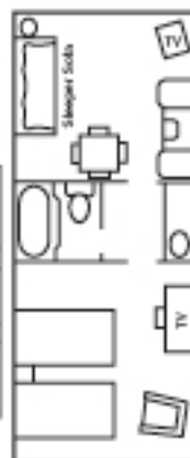
TYPE F and G